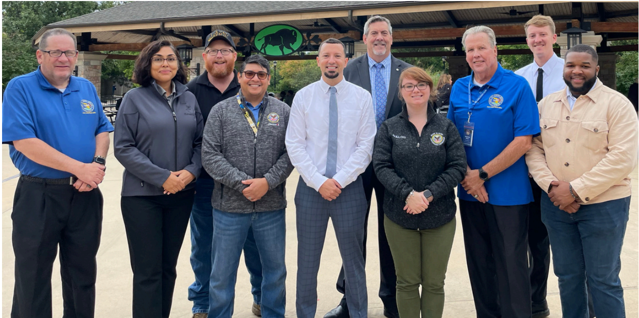
Intergovernmental Taskforce on Veterans Affairs

The Mayor's Office of Veterans Affairs (MOVA) collaborates with federal, state, county, and local city departments to develop strategies for enhancing prosperity within the Veteran community. This Introductory Guide on Veteran Affairs is designed to help Veterans understand and access the benefits and resources they have earned by providing an overview of each department. This guide will be updated regularly and will continue to evolve as more benefits become available. For more detailed information or to explore additional programs, please contact the relevant departments for a comprehensive list of services.