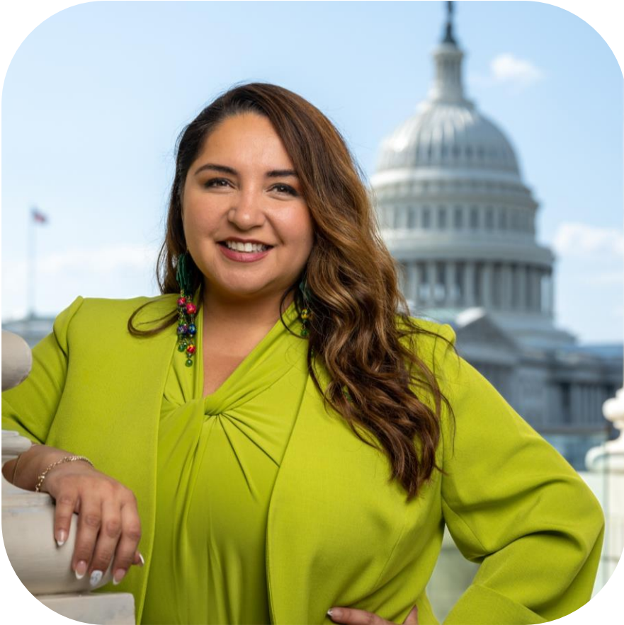
Congresswoman Delia C. Ramirez