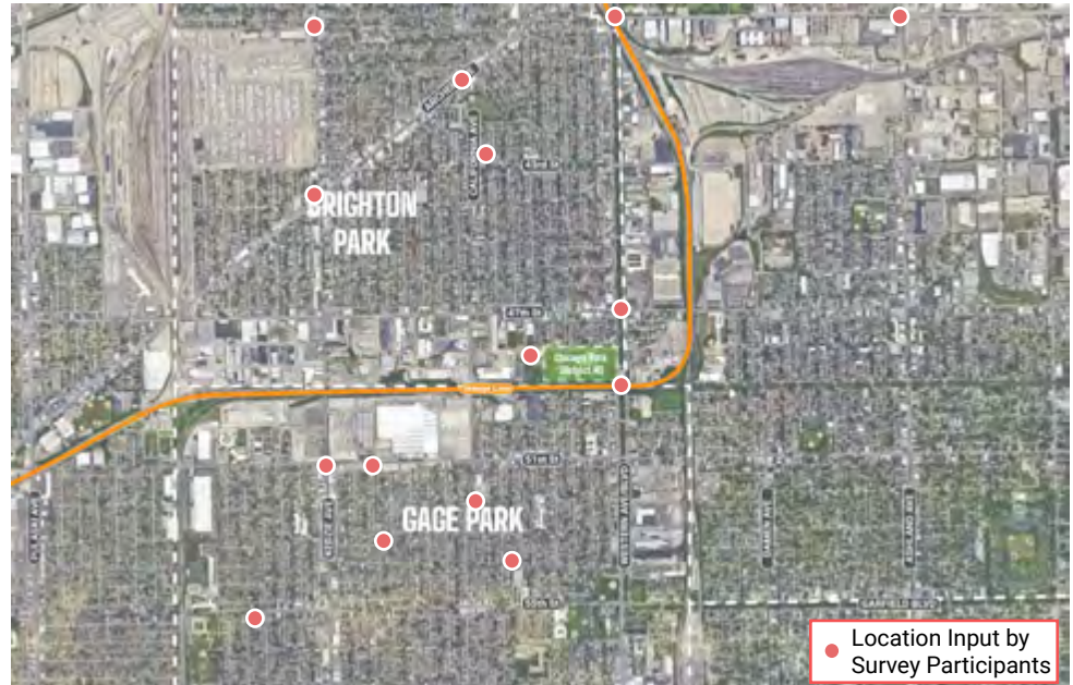
Map of Locations that need attention or improvements. (Answered by 15, Skipped by 37)

There are concerns about safety, infrastructure, pedestrian accessibility, and community amenities to improve street intersections. There is a desire for increased police presence and enhanced security measures to ensure safety at intersections. Many responses highlight the importance of pedestrian safety.