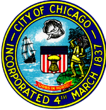
EXHIBIT 3 SPECIAL CONDITIONS REGARDING MBE/WBE COMMITMENT AND MBE/WBE COMPLIANCE PLAN