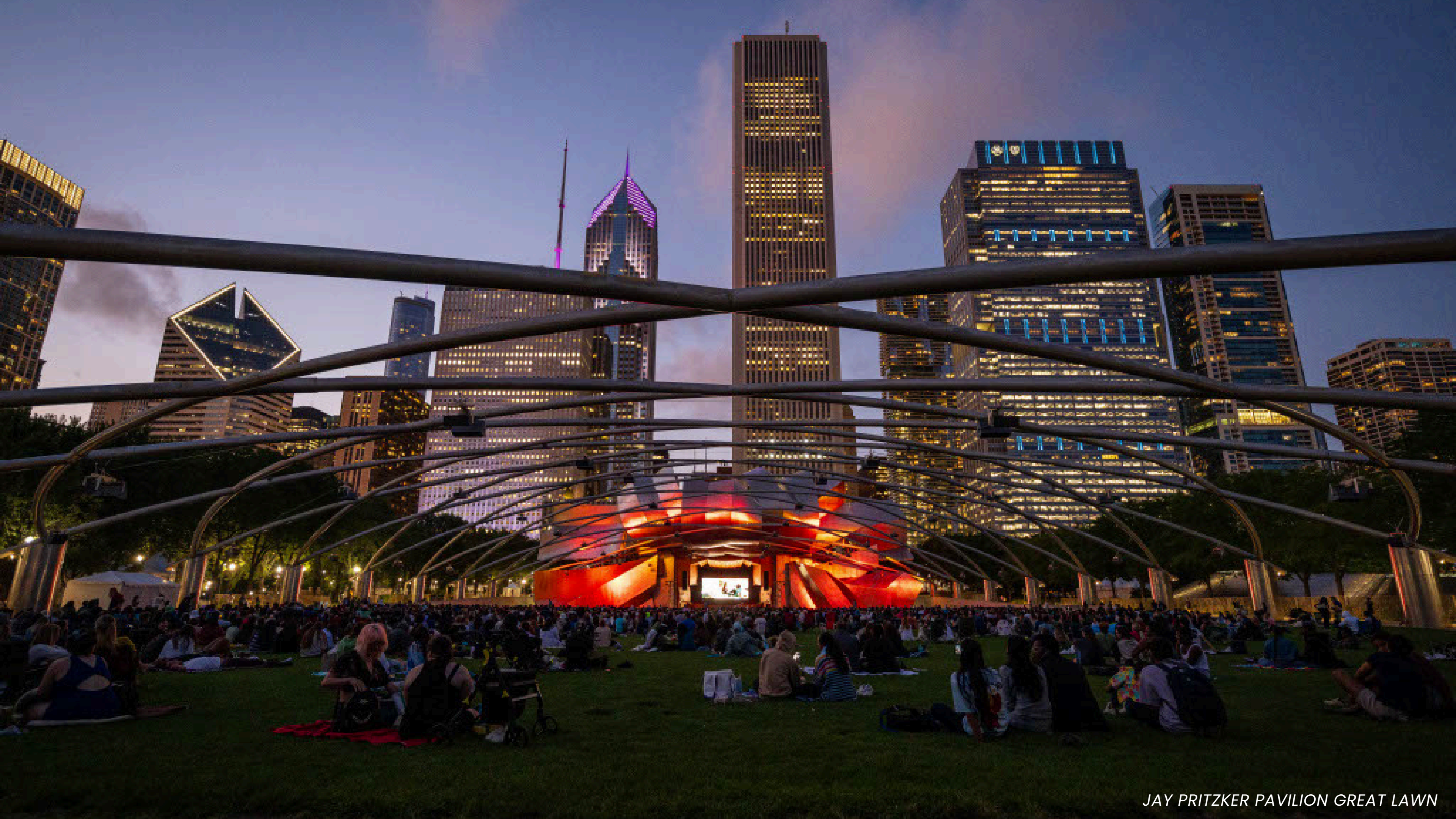
JAY PRITZKER PAVILION GREAT LAWN