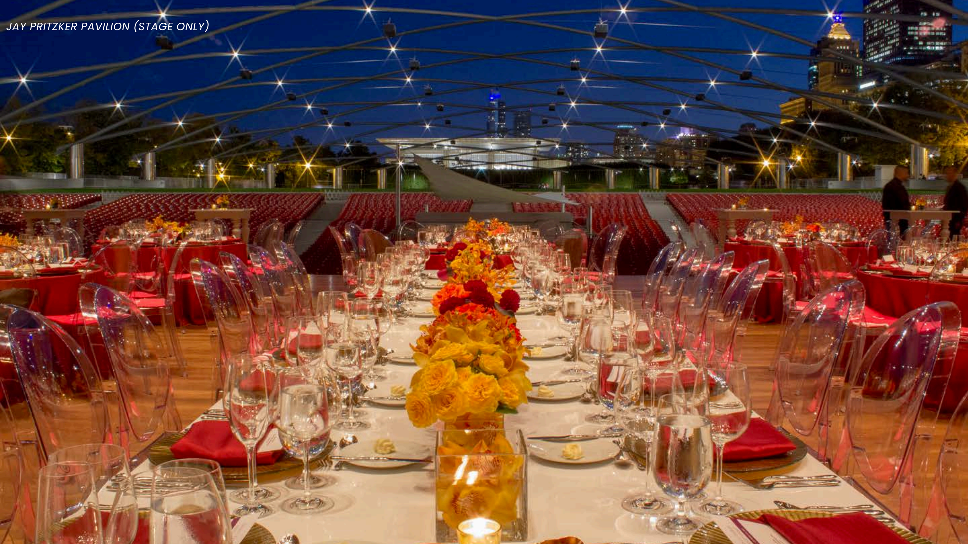
JAY PRITZKER PAVILION (STAGE ONLY)