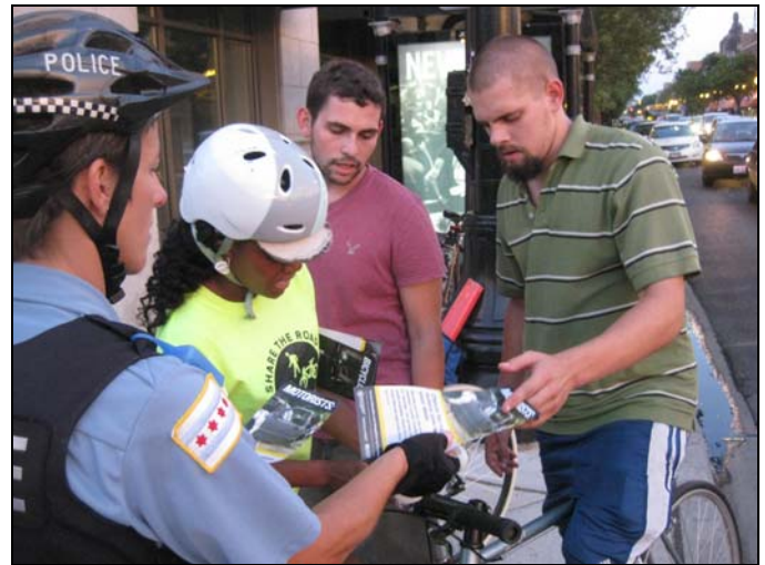
Ambassador La'Quita encourages cyclists to use a front white headlight at dusk during a Bike Light Distribution event.

Share the Road publications were distributed at each enforcement event; these flyers address dangerous behaviors and serve as a warning for both motorists and cyclists. In 2012, the Ambassadors handed out 2,200 front white headlights to cyclists riding at night without one. Headlights were made available by participating aldermen, chambers of commerce, Special Service Areas and CDOT. Ambassadors positively reinforced bike safety messaging amongst Lakefront Trail users with 2 Share the Trail awareness events, distributing 100 bells to cyclists to encourage safer Trail behavior.