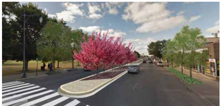
Typical median design with safety improvements