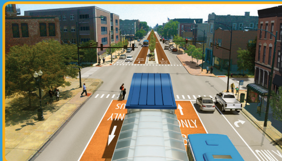
Ashland Avenue: Irving Park Road to 95th Street