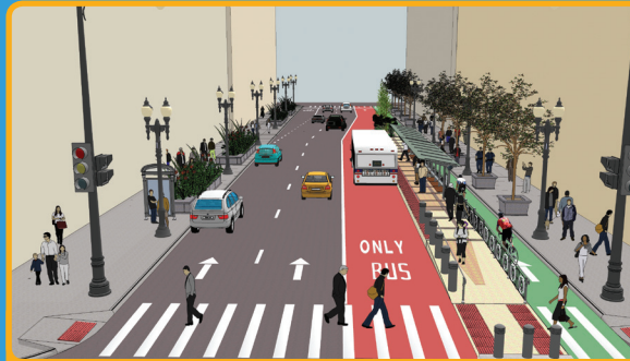
Central Loop: Union Station to Michigan Avenue

CTA and the City of Chicago tested elements of BRT with the Jeffery Jump, and, after positive results, are planning full BRT routes that service neighborhoods and businesses. Planned BRT routes include: