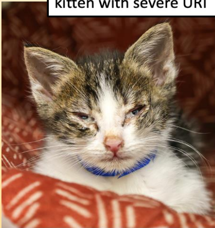
Ermine - former stray kitten with severe URI