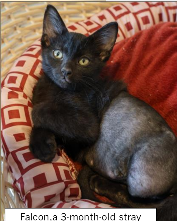
Falcon, a 3-month-old stray kitten that was brought into CACC with an open, severe femoral fracture.