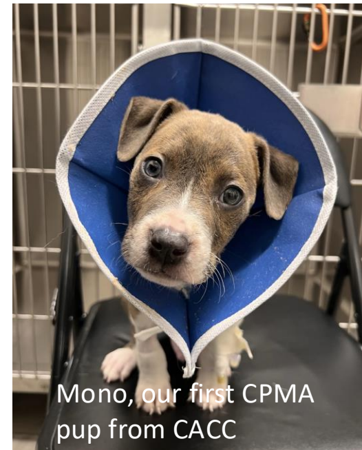
Mono, our first CPMA pup from CACC