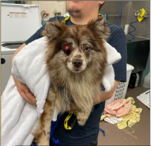
Akuma arrived at CACC in a lot of pain from a bulging eye.