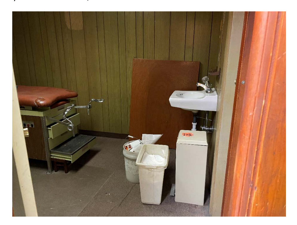
Photo 10 - View of one of the rooms on the east side of the main floor, previously utilized as an examination room. Photo taken facing southwest.