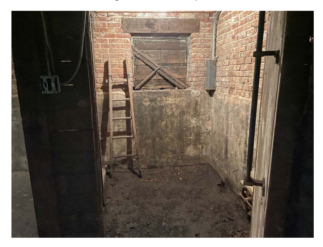
Photo 14 - View of the northwest corner of the basement, facing west.