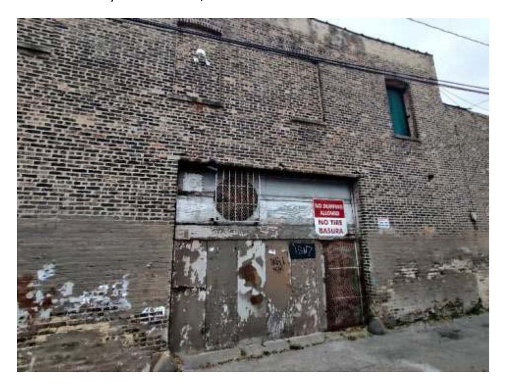
Photo 8 – Rear of 2010 S. Ashland Ave. garage structure along the alley, facing east.