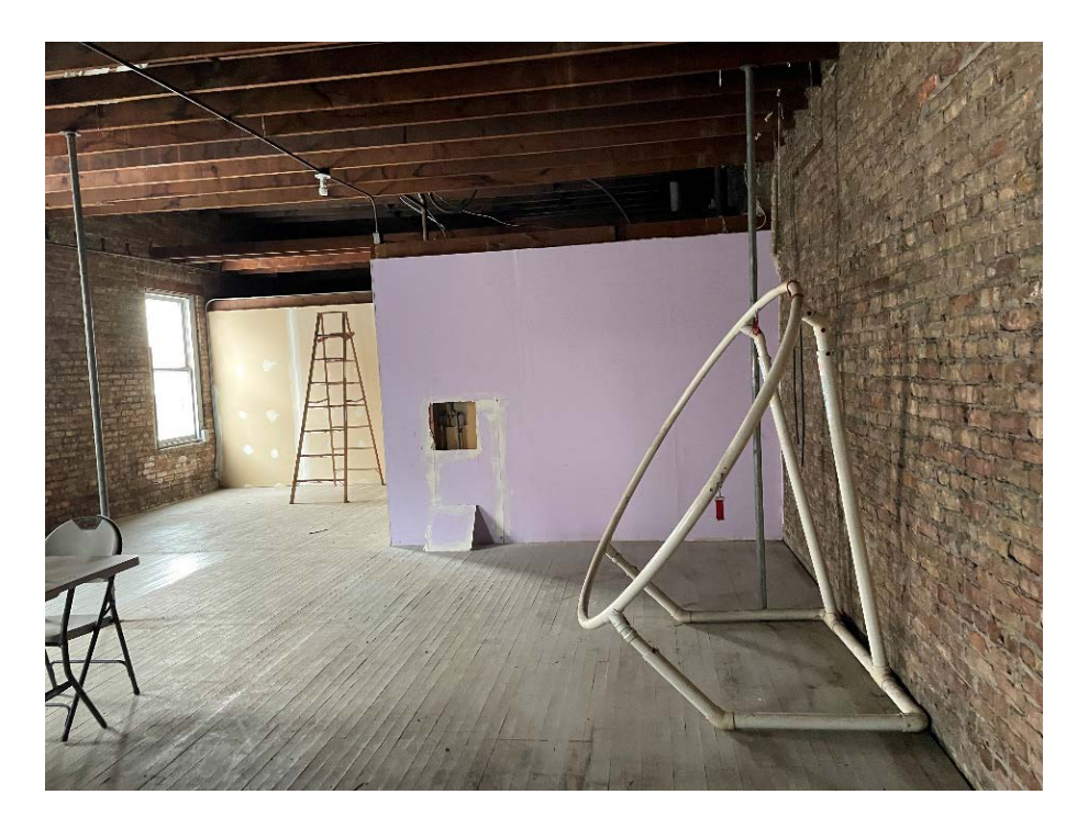
Photo 15 – View of the westernmost room on the second floor, facing east.