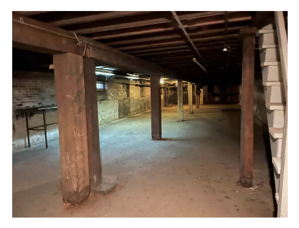
Photo 13 – View of the basement, facing east.