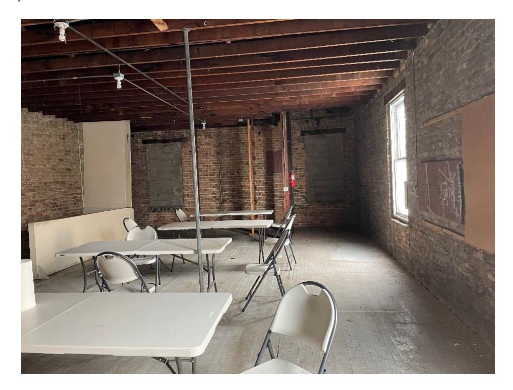
Photo 16 - View of the westernmost room on the second floor, facing west.