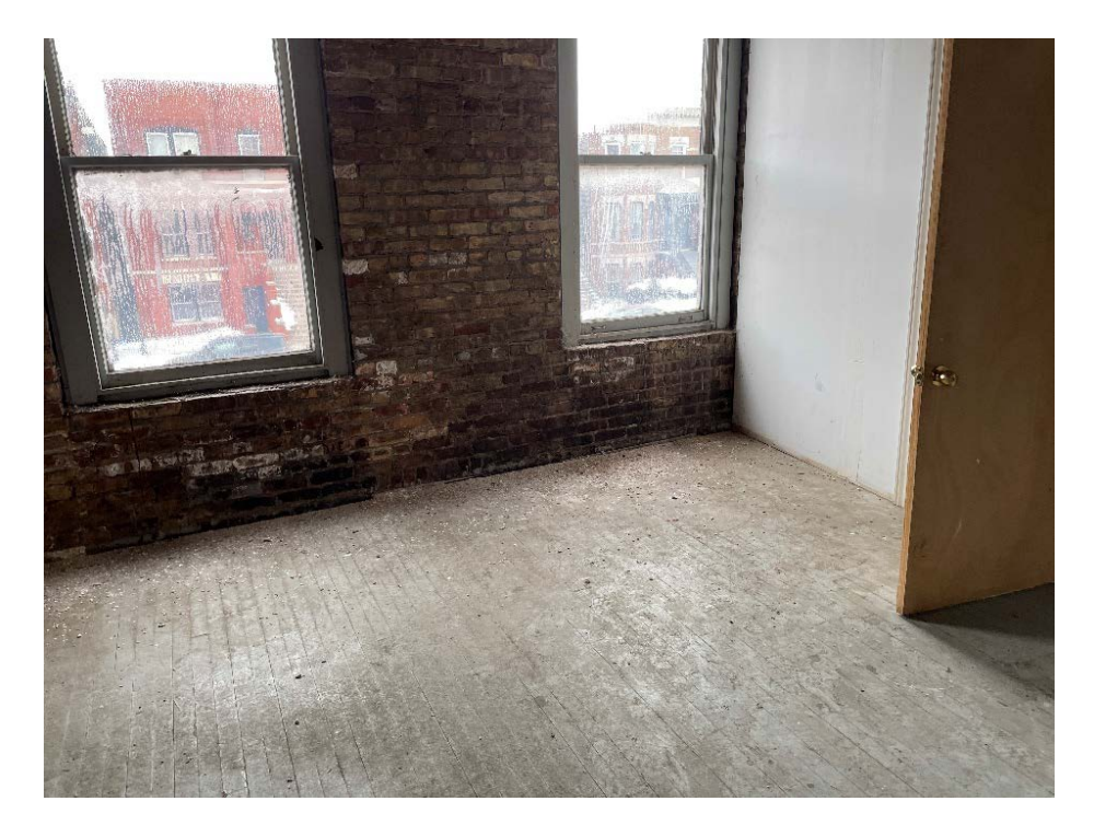
Photo 17 – Easternmost room on the second floor, facing southeast.