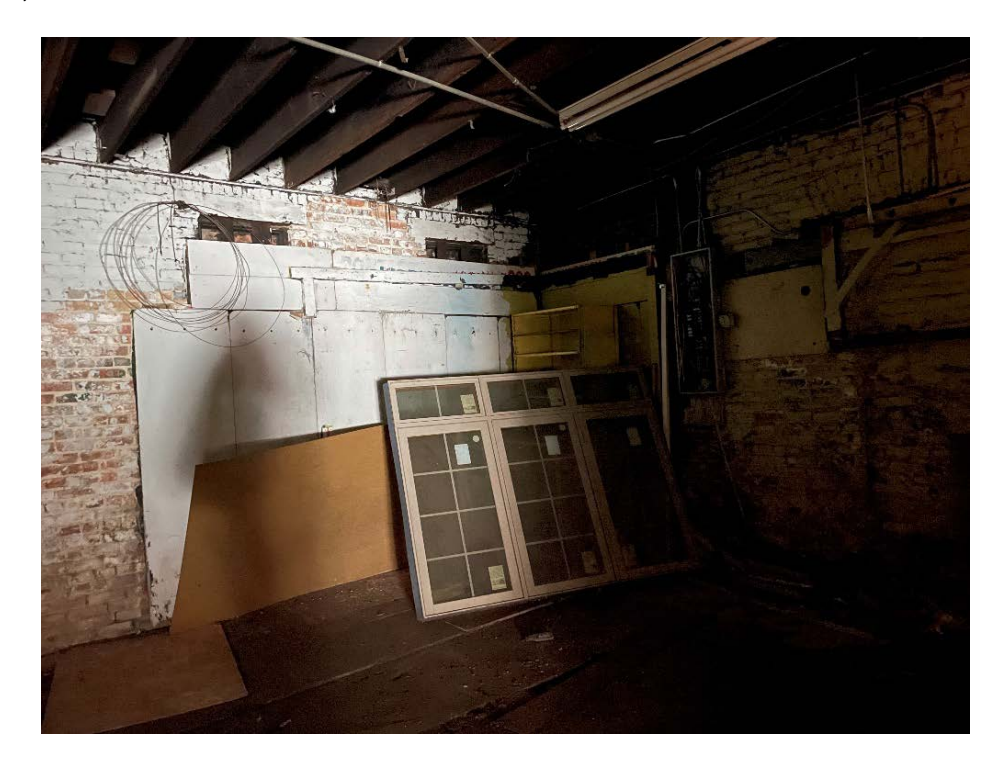
Photo 20 – Southernmost room in the second building, facing southwest.