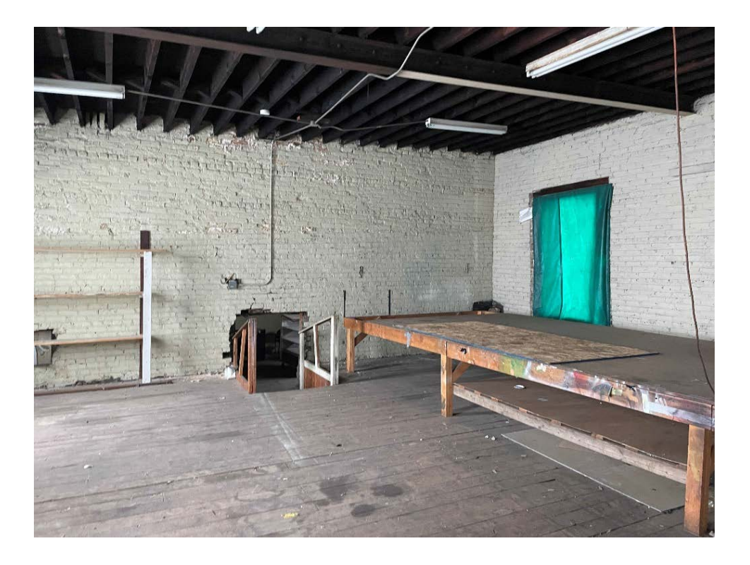
Photo 27 – Second floor of the garage facing southwest.