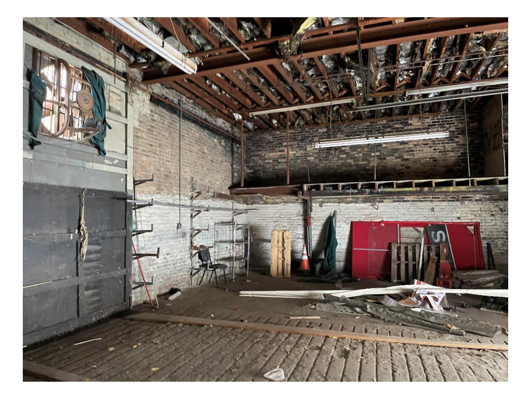
Photo 23 – Main floor of the garage (2010 S. Ashland Ave.) facing northwest.