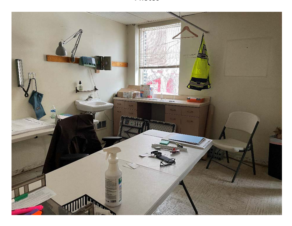
Photo 11 - View of one of the rooms on the north side of the main floor, currently being utilized as an office, facing northwest.