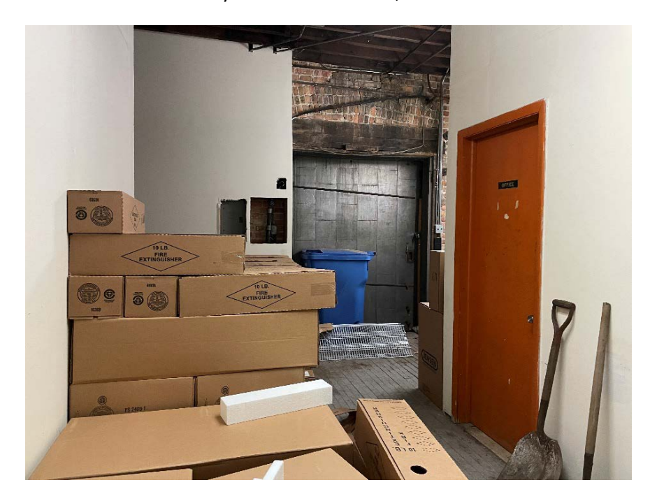
Photo 12 - View of the western most room on the main floor of the building with entry points to the basement, second floor and the second building on site, photo taken facing west.