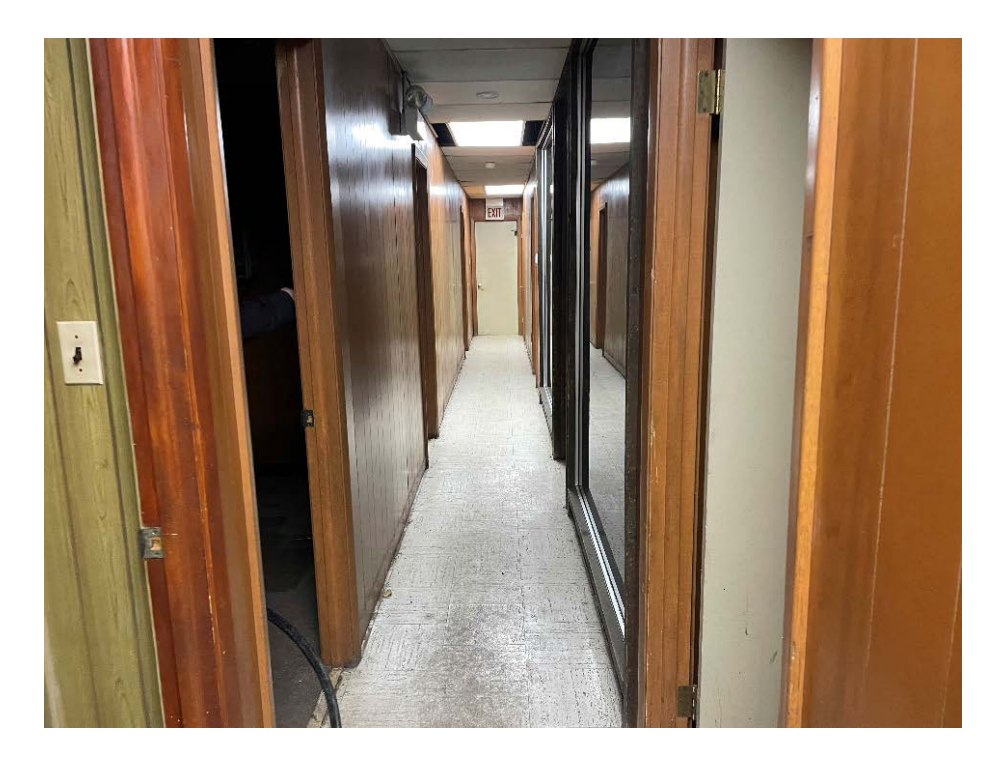
Photo 9 - View of the main corridor running east to west through the building. Photo taken facing west.