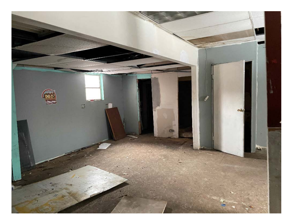
Photo 19 – Easternmost room in the second building, facing southwest.