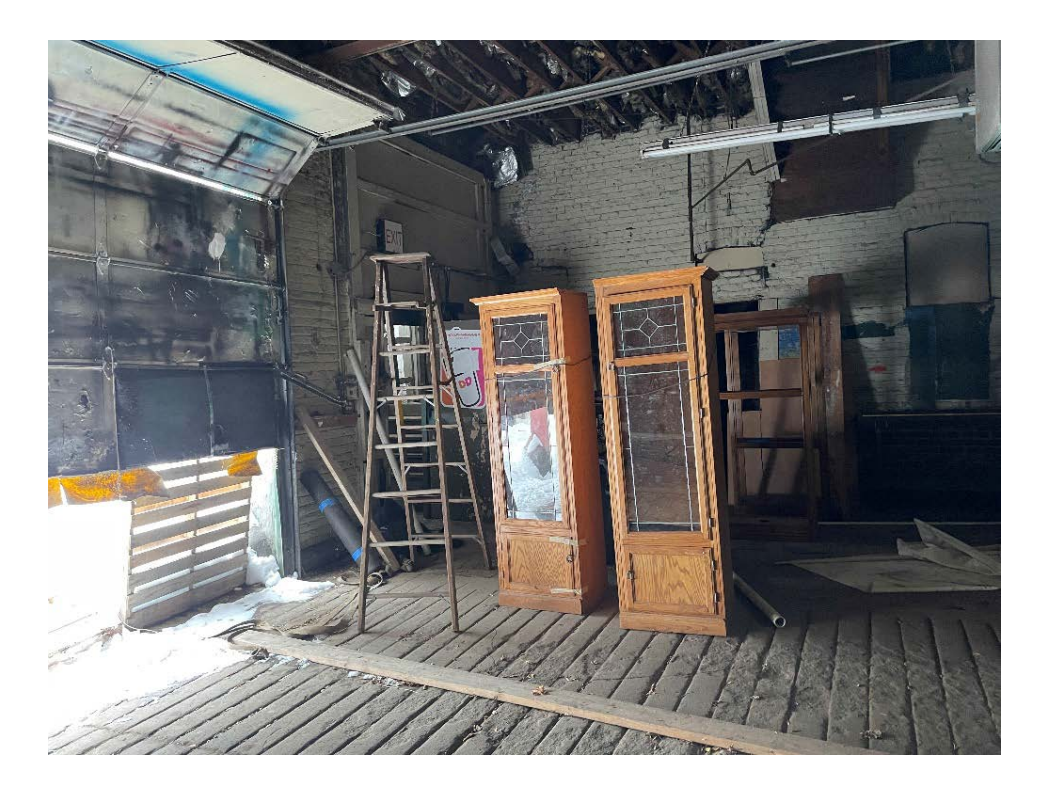
Photo 25 – Main floor of the garage facing southeast.