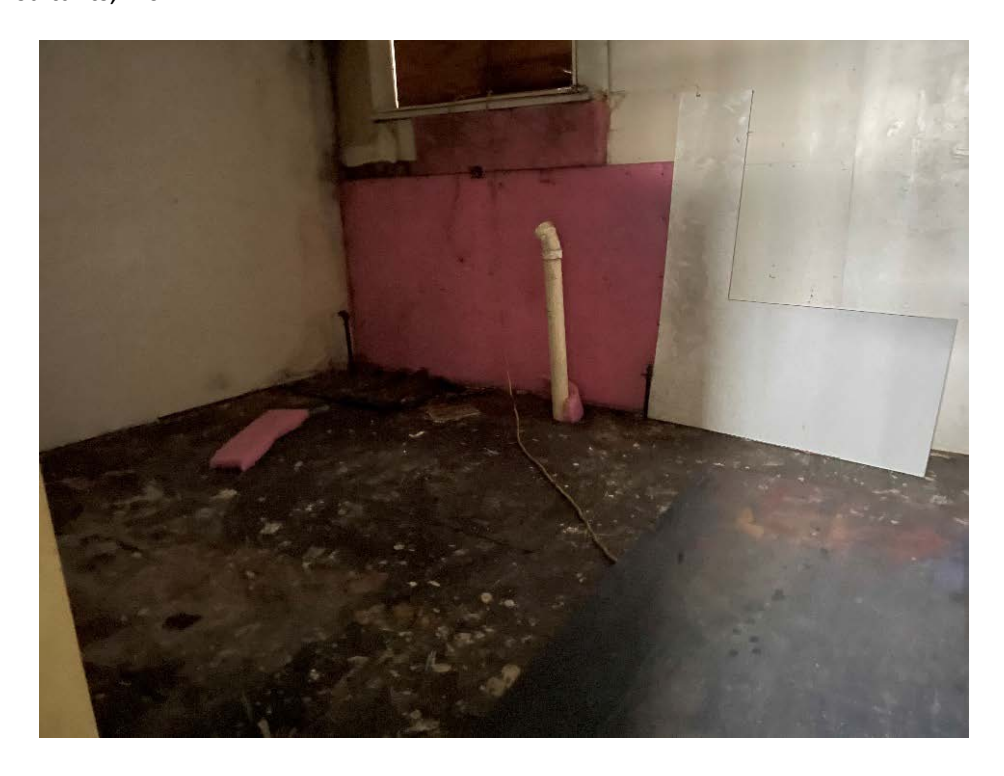
Photo 22 – Room situated on the east side of the second floor of the second building, facing northeast.