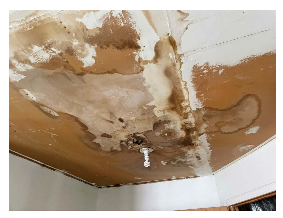
Photo 18 - Section of the second-floor ceiling, showing significant disrepair.