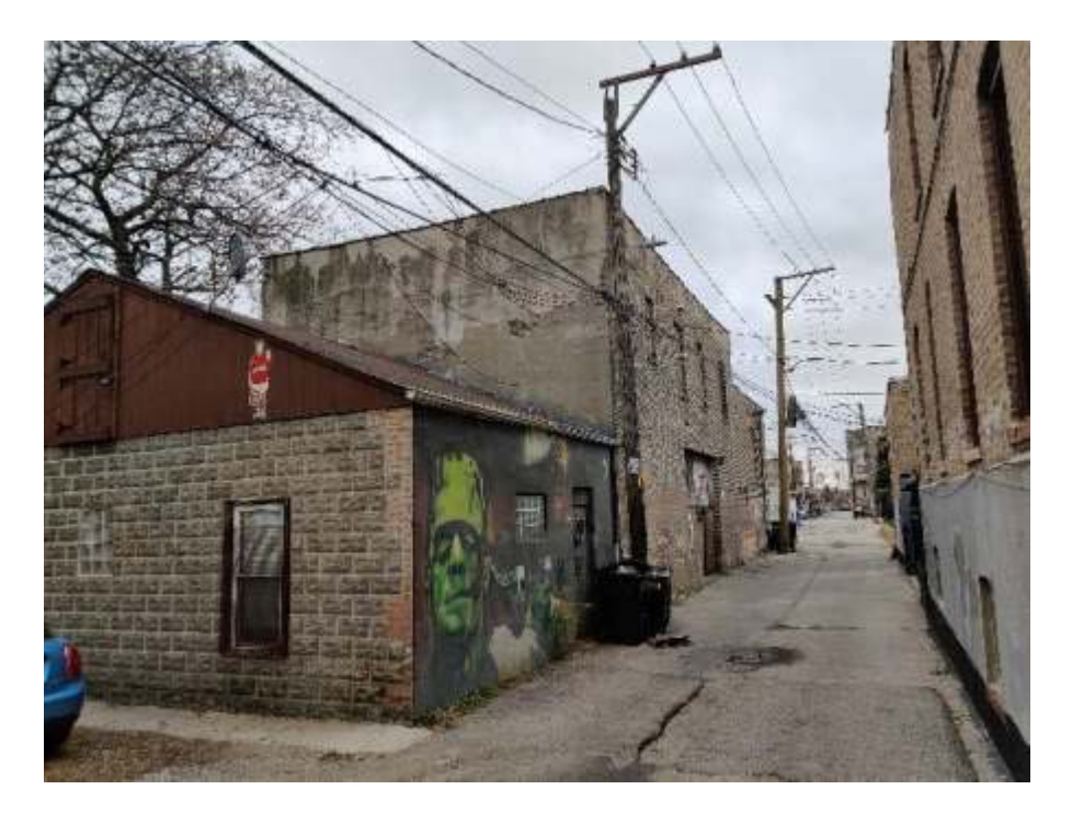
Photo 7 - Rear of 2010 S. Ashland Ave. garage structure along the alley, looking southeast from W. Cullerton St.