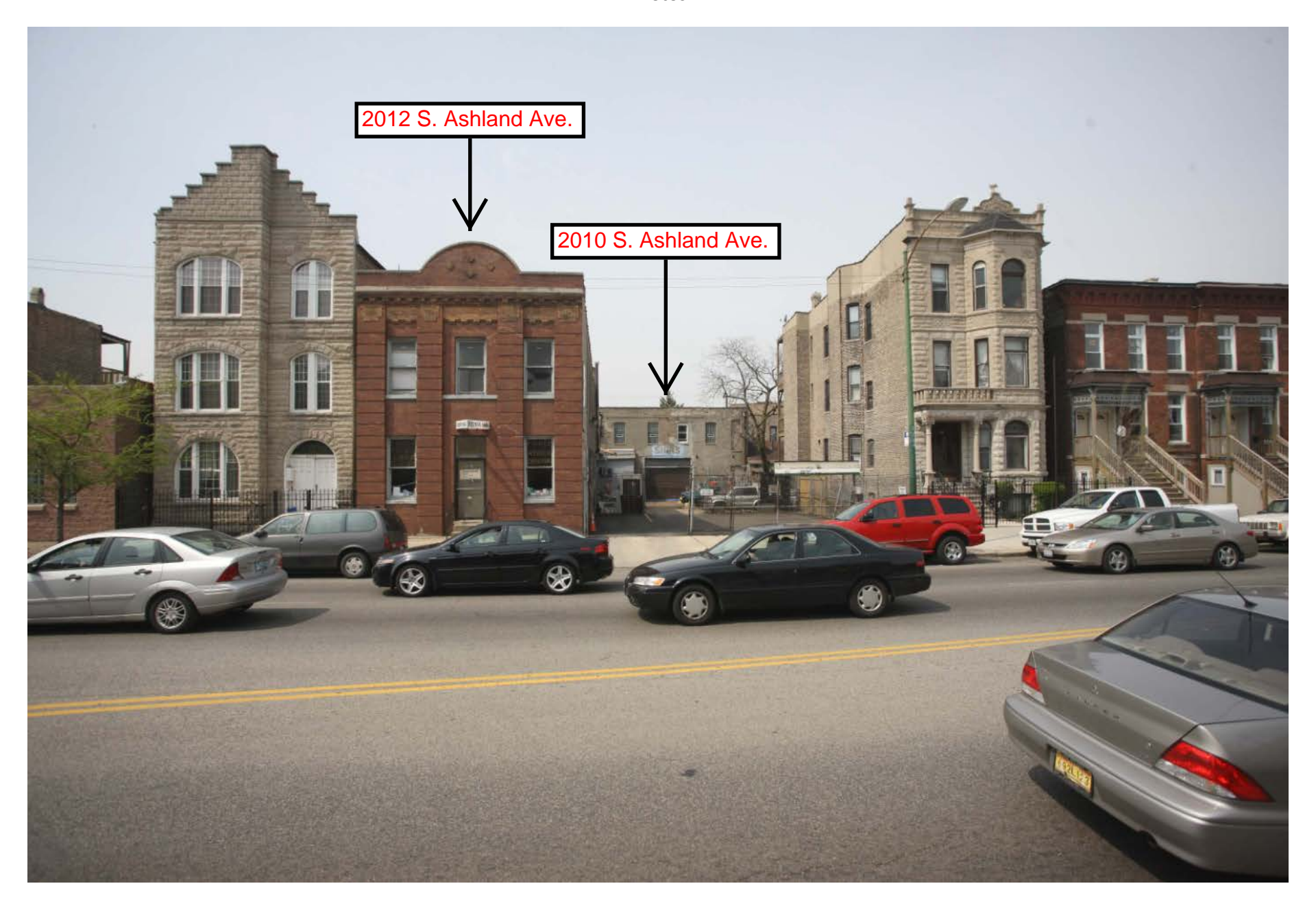
Photo 1 – Subject site and adjacent properties as seen from across S. Ashland Ave. looking west. Subject buildings identified by address.