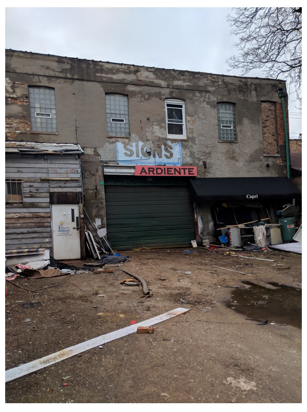
Photo 6-View of 2010 S. Ashland Ave. garage structure facing west.