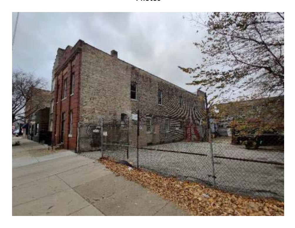
Photo 4 – Northeast corner of 2012 S. Ashland Ave. facing south west along S. Ashland Ave.