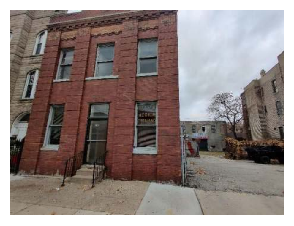
Photo 2 – Close up of 2012 S. Ashland Ave. with 2010 S. Ashland Ave. garage structure in the background and 2008 S. Ashland Ave. vacant lot in the foreground. Facing west.