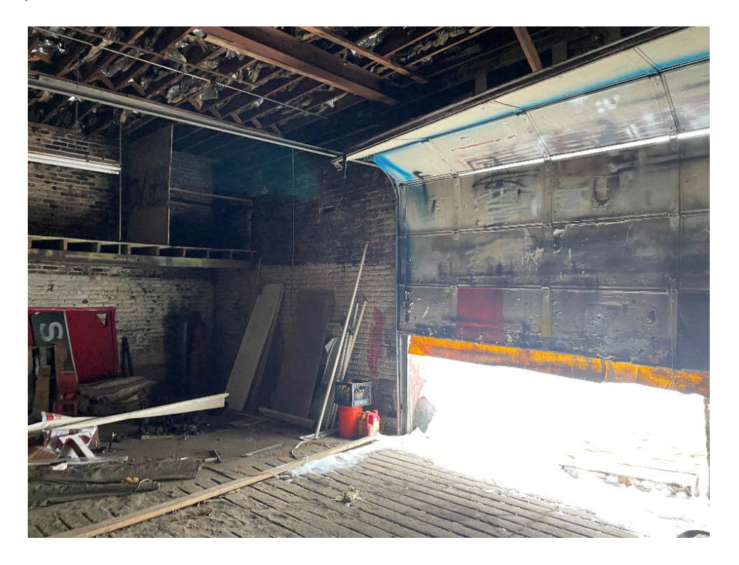
Photo 24 – Main floor of the garage facing northeast.