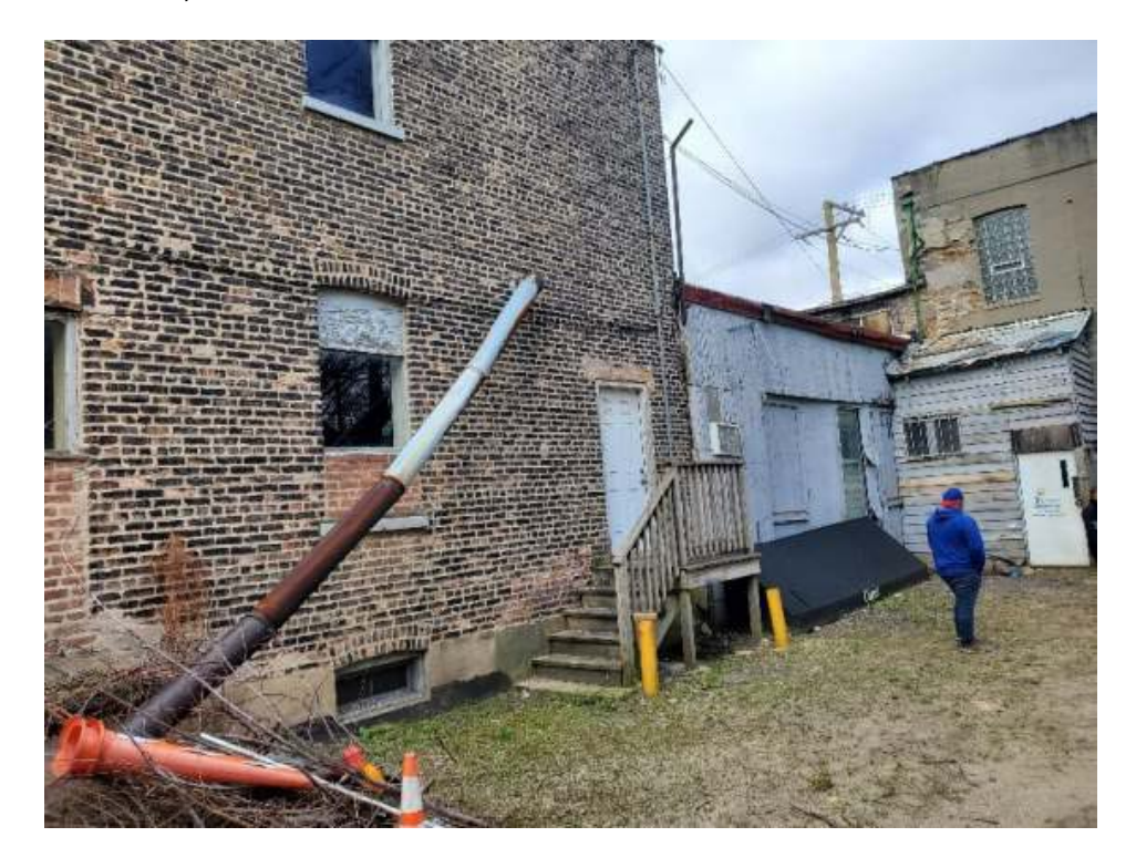
Photo 5 – View of the northern side of 2012 S. Ashland Ave. and the adjoining, single-story structure interconnected to 2010 S. Ashland Ave. Facing southwest.