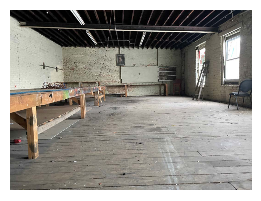
Photo 26 – Second floor of the garage facing north.