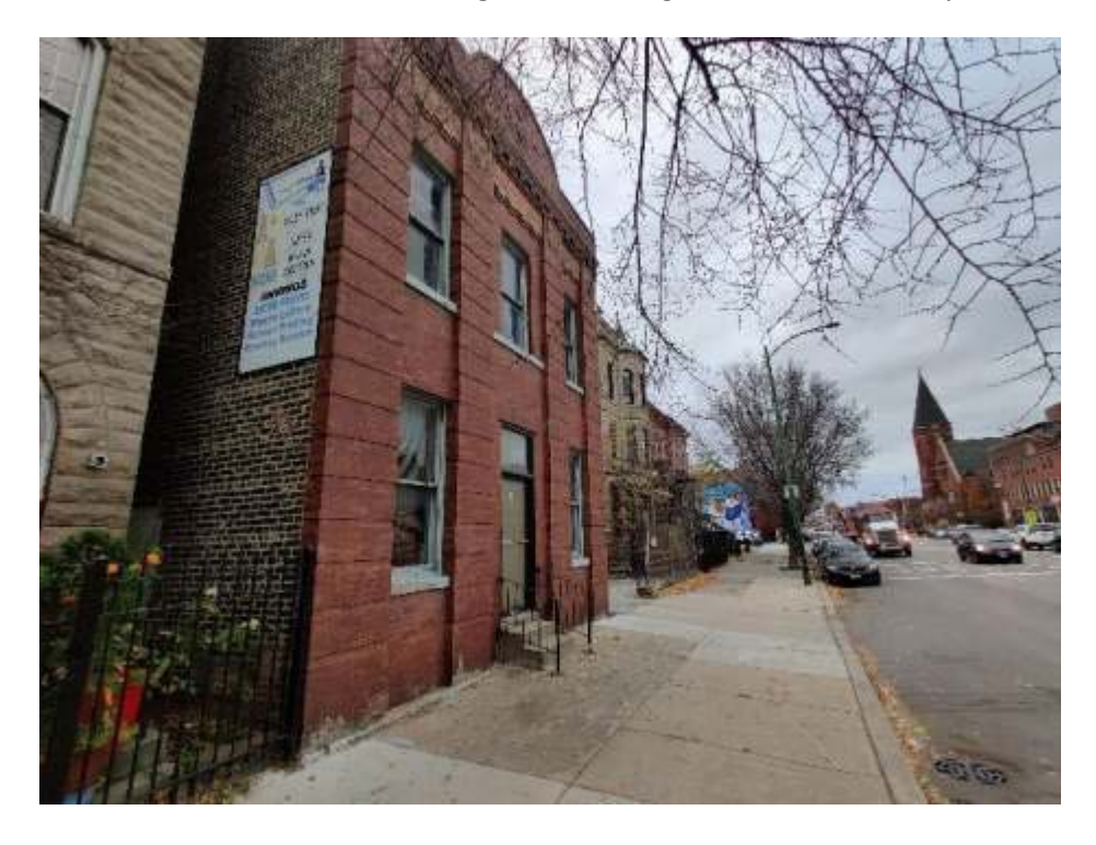
Photo 3 – Southeast corner of 2012 S. Ashland Ave. facing northwest along S. Ashland Ave.