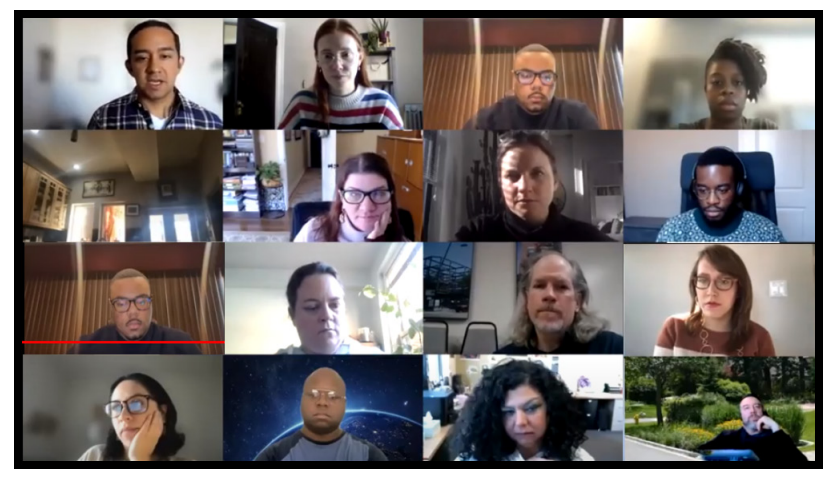
Attendees of an ETOD community engagement session met virtually in a breakout room to discuss shared values and priorities to inform the City's ETOD HREIA.

Content experts also compiled data from existing plans and assessments of TOD in Chicago and conducted a literature review to supplement recommendations from community members. The HREIA participant quotes included throughout this report are drawn directly from these engagement sessions.